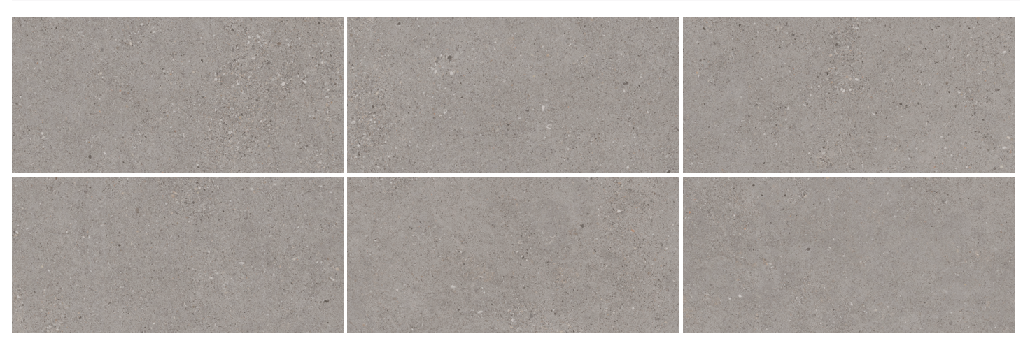
CST30 French Gray