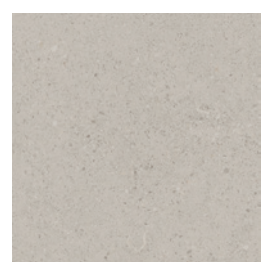
CST20 Café Light Gray