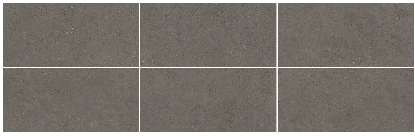
CST50 Black Bayou