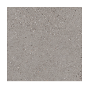
CST30 French Gray