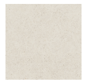
CST<sub>10</sub> Levee White