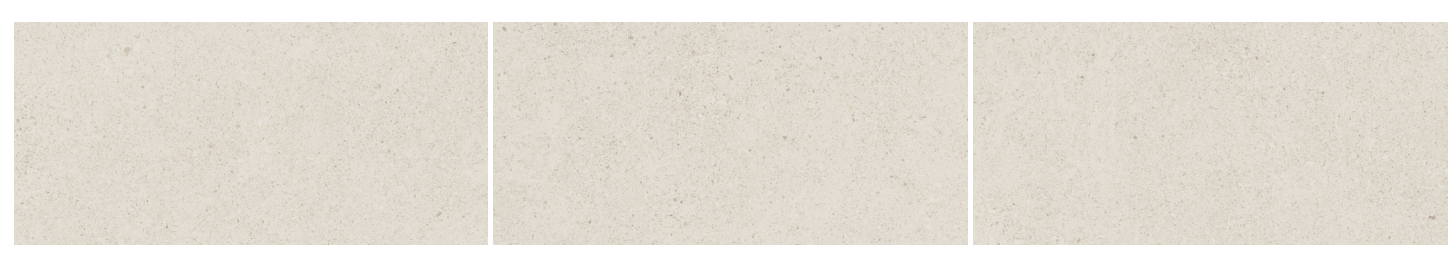
CST10 Levee White