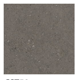
CST50 Black Bayou