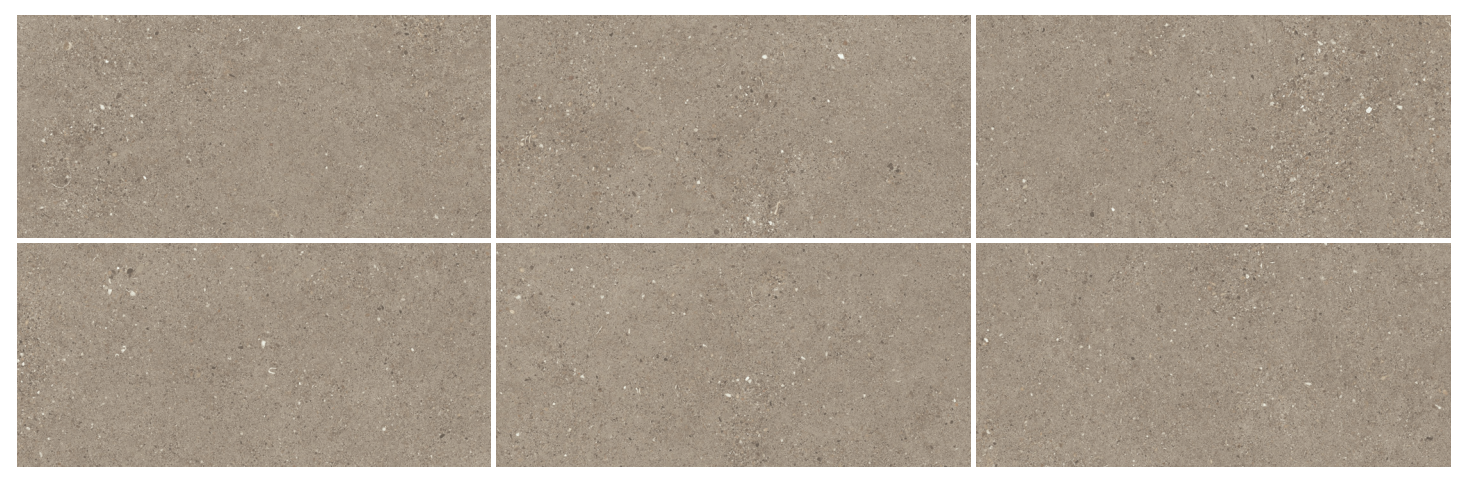
CST40 Spanish Clay