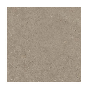
CST40 Spanish Clay