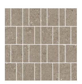
CST40/M12REC Spanish Clay 32pc