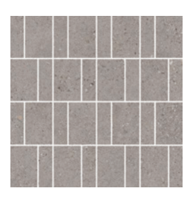
CST30/M12REC French Gray 32pc