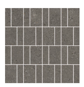
CST50/M12REC Black Bayou 32pc